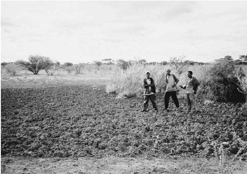
Picture 3 The dry basin located at the center of ǁQâots'ii