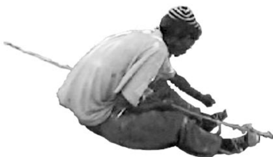
Picture 4 K held out his left hand to take the strings used to bind the rod.